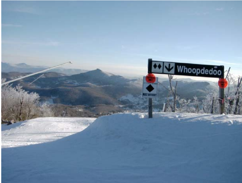
The world as seen from the top of Sugar.

Southern Cross / National Ski Patrol c/o Bob Weed 2609 Willena Drive, Huntsville, AL 35803