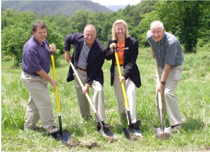
Click to view Photo Album