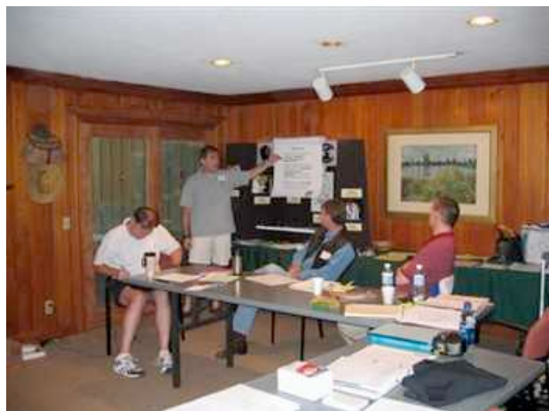
Instructor Development class in Atlanta, GA (Roswell, GA) with students from Cataloochee, Cloudmont and Sapphire Valley. The Instructors were from Beech, Cataloochee, Cloudmont, and Hawksnest. Class was held at the Chattahoochee River Environmental Education Center.