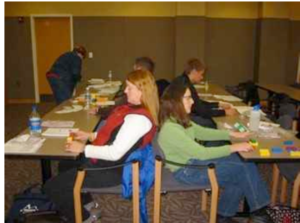
Instructor Development students and instructors using building blocks in Boone, NC @ Watauga Medical Center April 14, 2007