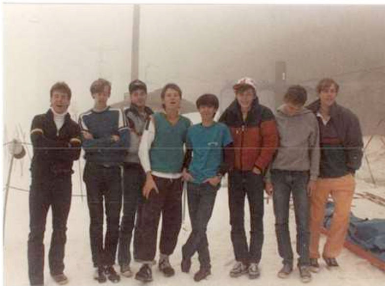
Oak Ridge Juniors 1987 at Hawksnest