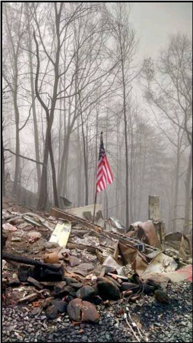
The Jucker foundation - All that is left of over 500 homes just in the Chalet Village area.